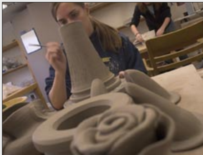
As the school year wound down, several students finished semester-long projects. Students in the art department were no exception, as several of them spent time in the Art Annex to complete ceramic pieces.